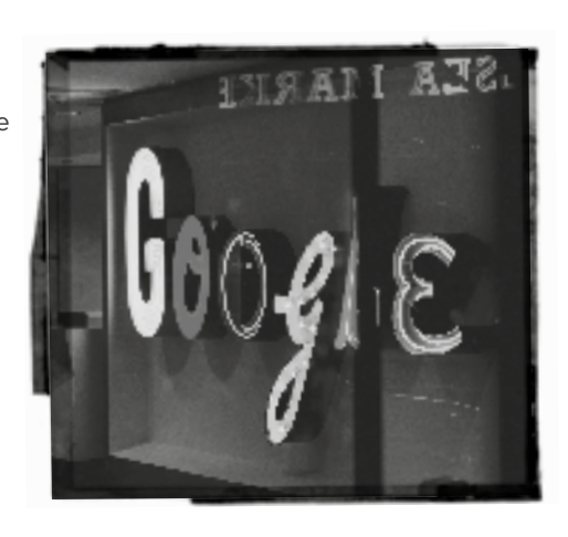
Search makes it easier to 'prove' the things we already believe and ignore contradictory evidence

THESE FACTORS ARE CHANGING THE NATURE OF POLITICAL DEBATE, ATTITUDES TOWARD BUSINESS, RELATIONSHIPS IN THE WORKPLACE, NEWS CONSUMPTION AND THE BEHAVIOURS WE EXPECT FROM BRANDS: