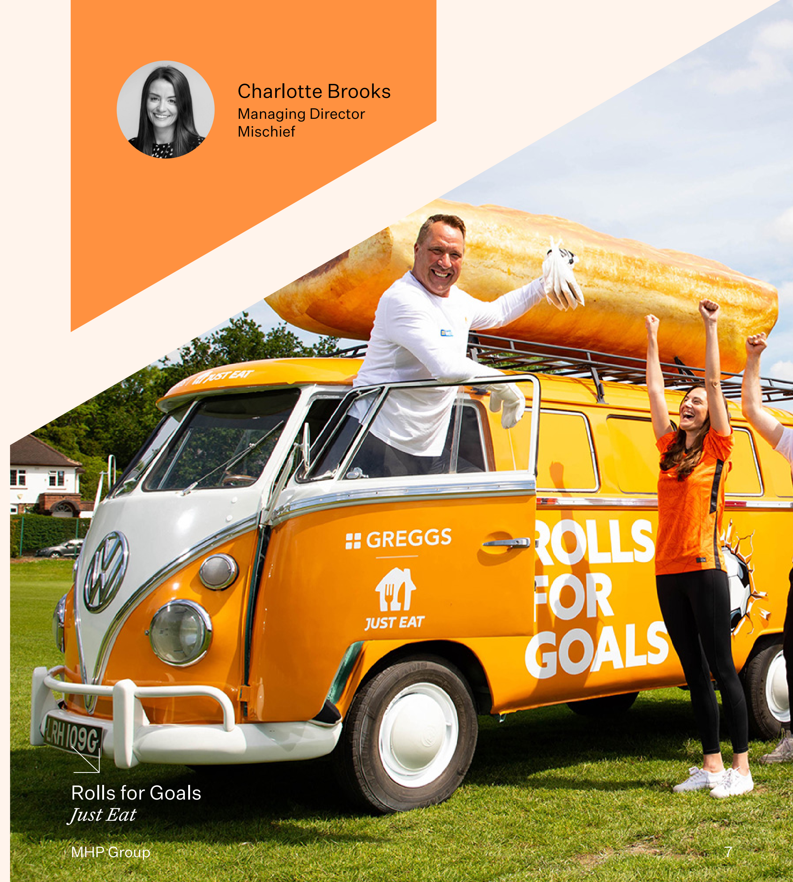
Rolls for Goals Just Eat